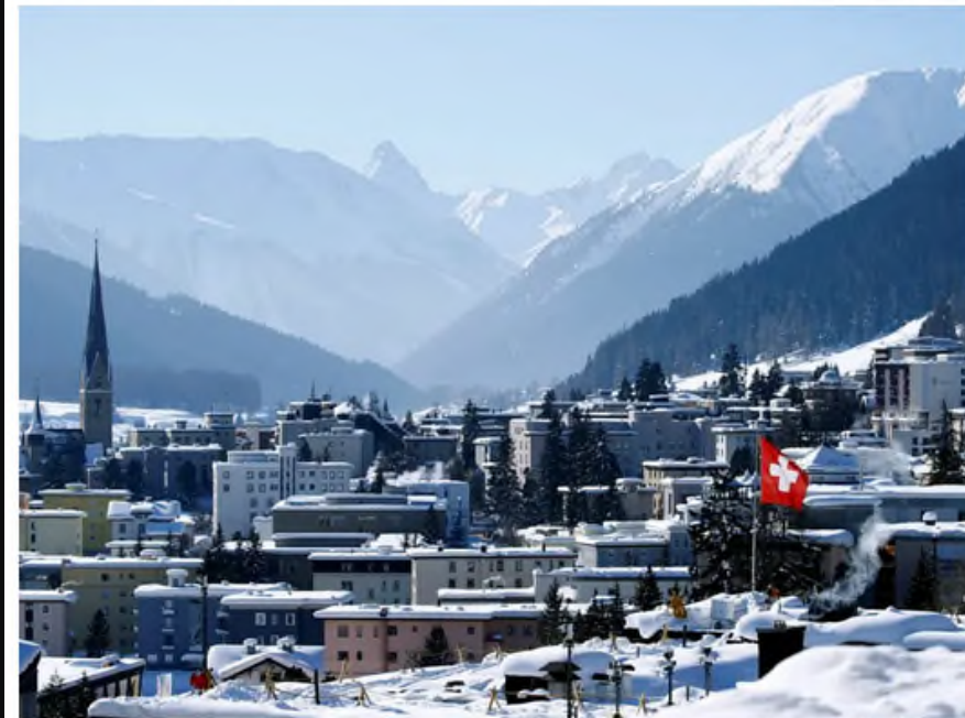
A general view shows the mountain resort of Davos, Switzerland, January 25, 2019