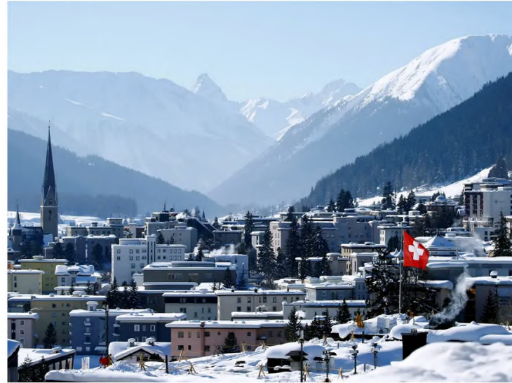
A general view shows the mountain resort of Davos, Switzerland, January 25, 2019